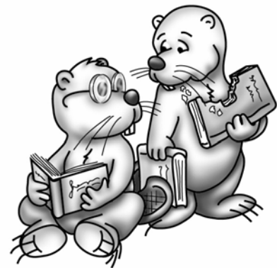
"But Chet, I thought you said it was food for thought!"